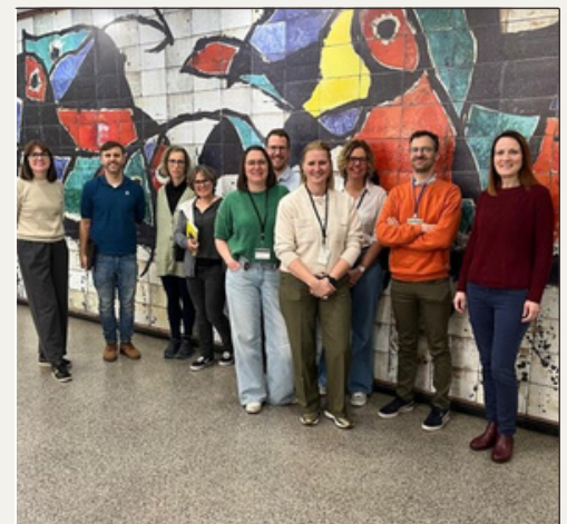
Barcelona (Catalonia) February 2025

Following the match, the institutions began preparing for the visit in February 2025. Over the course of three days , the group visited several institutions and businesses that are spearheading dual learning and VET in the region .