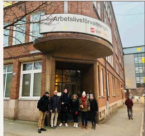
Borås (Sweden) December 2024

Following the match, the institutions began preparing for the study visit in December 2024. The Working Life Department of Borås developed a week-long program featuring meetings, visits, and peer learning opportunities with various stakeholders in the municipality. This collaboration brought together professionals from regional authorities and Vocational Education and Training schools to share best practices and explore strategies for promoting gender inclusion in vocational training, particularly in traditionally male-dominated fields.